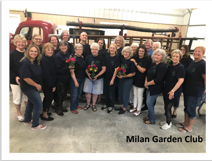
Milan Garden Club

This year marks the 25th Anniversary of Milan Garden Club. As a club, our goal and mission is to learn more about plant care, stimulate gardening, and promote home and community beautification and conservation. We plant and maintain the gardens at Friend-Hack House Museum in partnership with the Milan Area Historical Society.