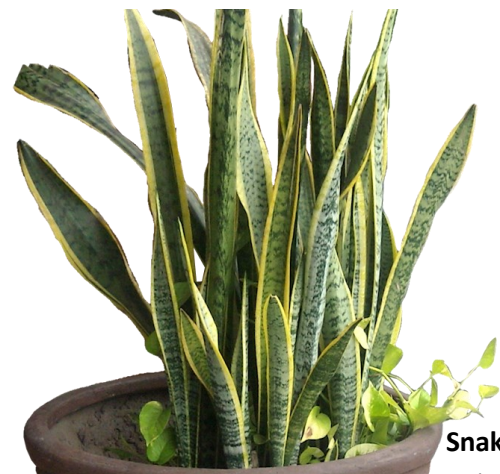
Snake Plant